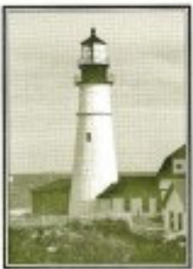
Since 1929, the lighthouse of the community

370 North First Street • St. Paul, Minnesota 55102